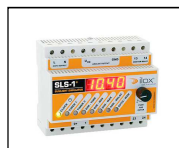
Sunlight simulator SLS-1+