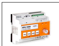
Dimmer controller EPU-1500